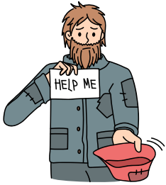
Live on street