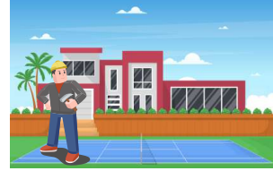
Your dream house

Create the blueprint and build your dream home.